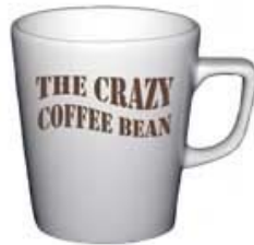
Option 2: Text enhanced using a simple effect.