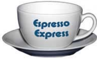
Option 1: Plain text, up to three lines, in any font or colour

Our free design service offers four options: