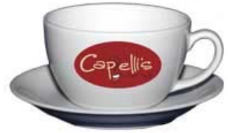
Option 4: Your own logo reproduced from supplied artwork.

Option 1 - Plain Text: Select a font from the supplied list. Fonts can easily express the style of your business, traditional or modern, and the more fancy ones can create a logo brand without any further additions. Select a colour that tones with your existing colour scheme. If you have a specific colour requirement and can specify the Pantone number, then we will try to match it as closely as possible. The name can be spread over 1,2 or 3 lines. The overall logo should have approximately a 2:1 aspect ratio to fit well on cups and mugs. If you wish to decorate plates, then we can curve the logo to match plate sizes—up to a maximum of three different logo sizes/curves in any minimum order of 48 items. Maximum logo size is 20 sq. cm.